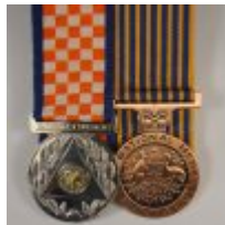
Court-mounted (on a rigid colour-matched background). Court mounting is the most common form for more than one medal.

It is recommended that members who have been awarded more than one medal have them professionally mounted.