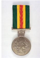
Swing mounted (hanging from a bar)

Medals, both full size and miniatures, may be mounted in two ways: